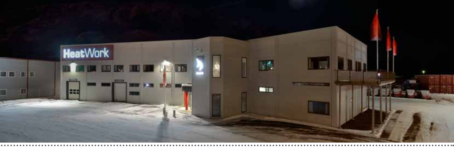
HeatWork headquarter and production site in Narvik, Norway - 3300 m<sup>2</sup> state of the art production facilities.