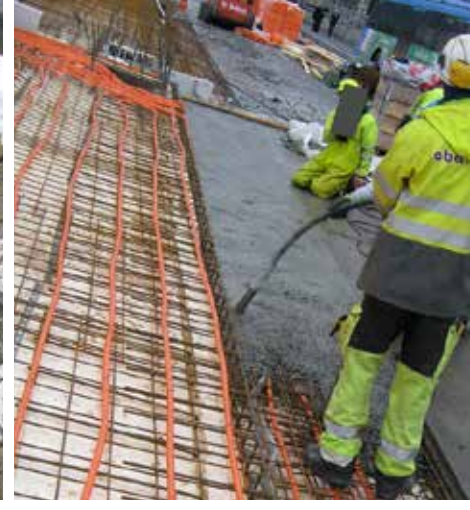
HeatWork sets a new benchmark for concrete work – reduce curing times by 85%!